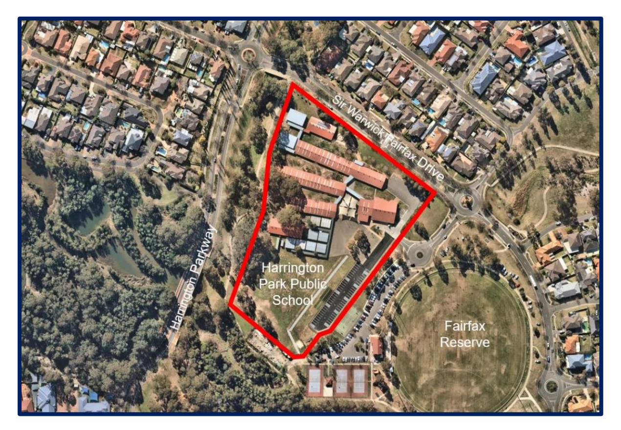
Figure 1: Aerial photograph of the development site