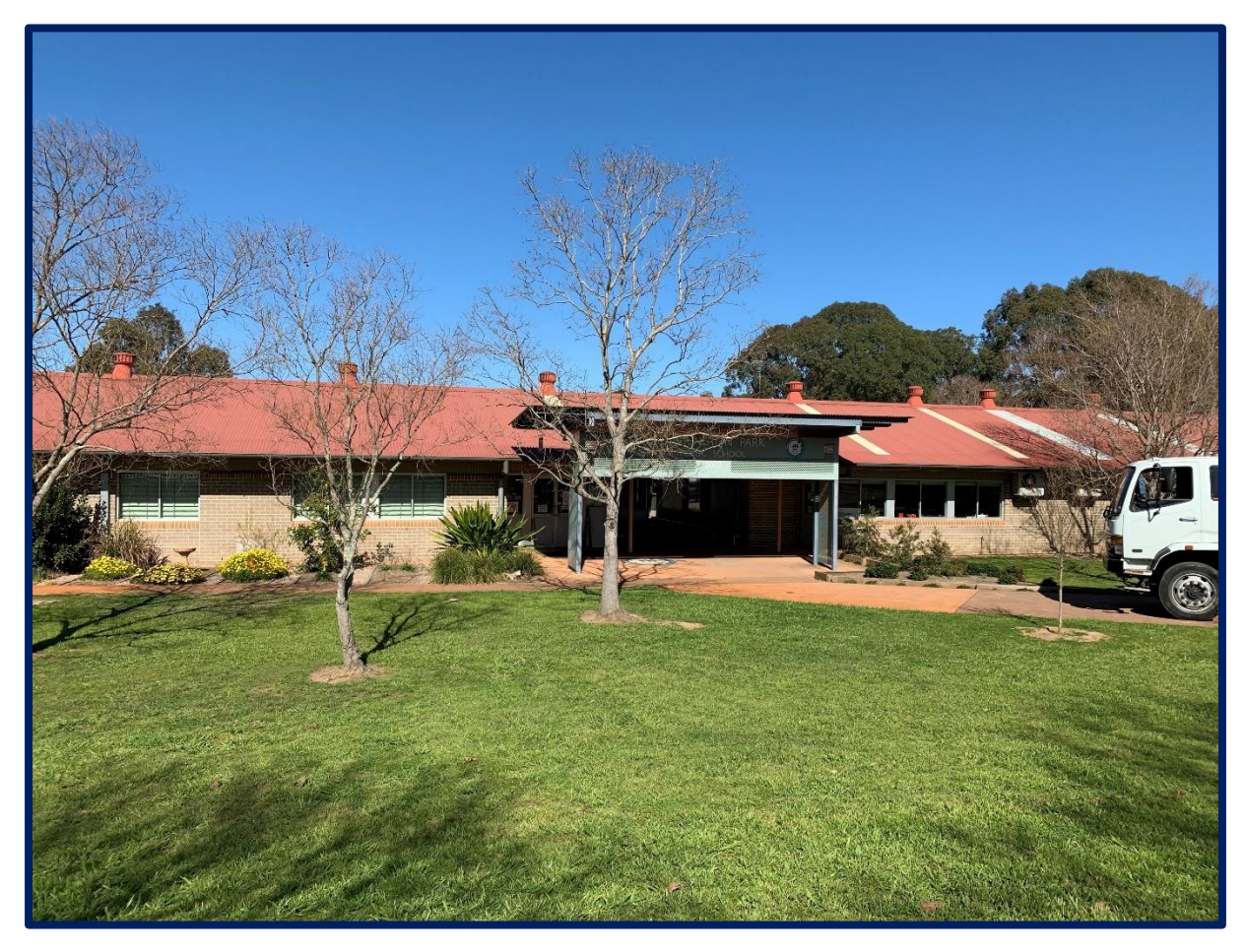
Figure 3: Schools Northern main entrance on Sir Warwick Fairfax Drive