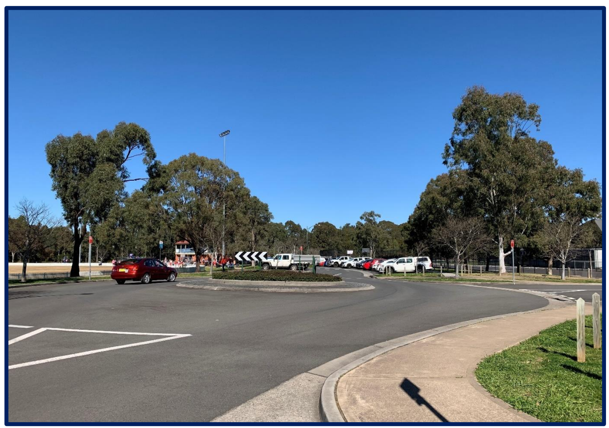
Figure 12: View of Fairfax Reserve and the access road roundabout subject to road upgrade works as part of this DA.

Figure 11: View of the second kiss and drop bay from the access road looking north toward Sir Warwick Fairfax Drive.