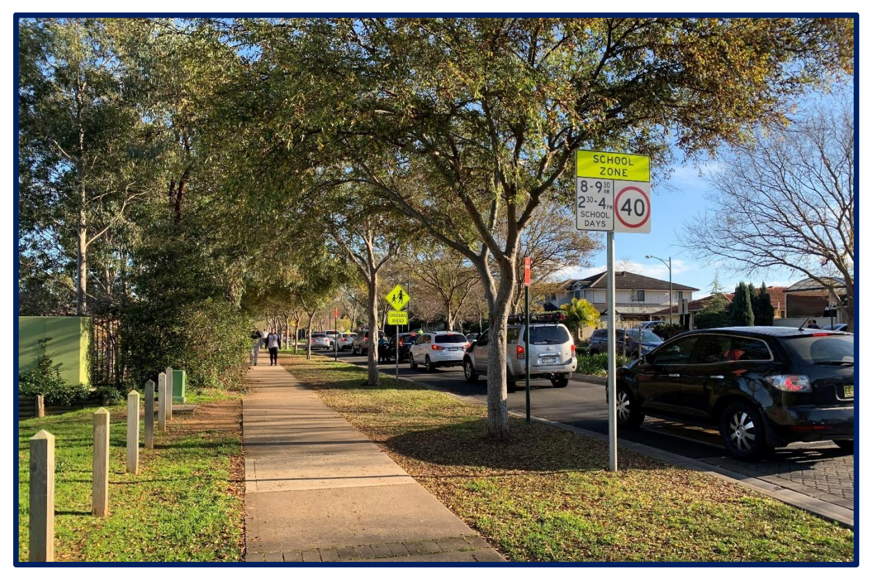
Figure 6: View looking North along Sir Warwick Fairfax Drive at 8:50am