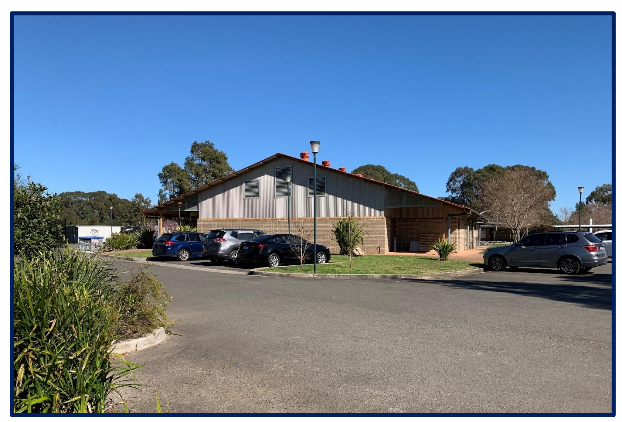
Figure 10: Existing Hall Building to be demolished and replaced with a new admin/library building.

Figure 9: View of the existing eastern car park and hall building which is to be demolished and replaced with a new library and administration building.