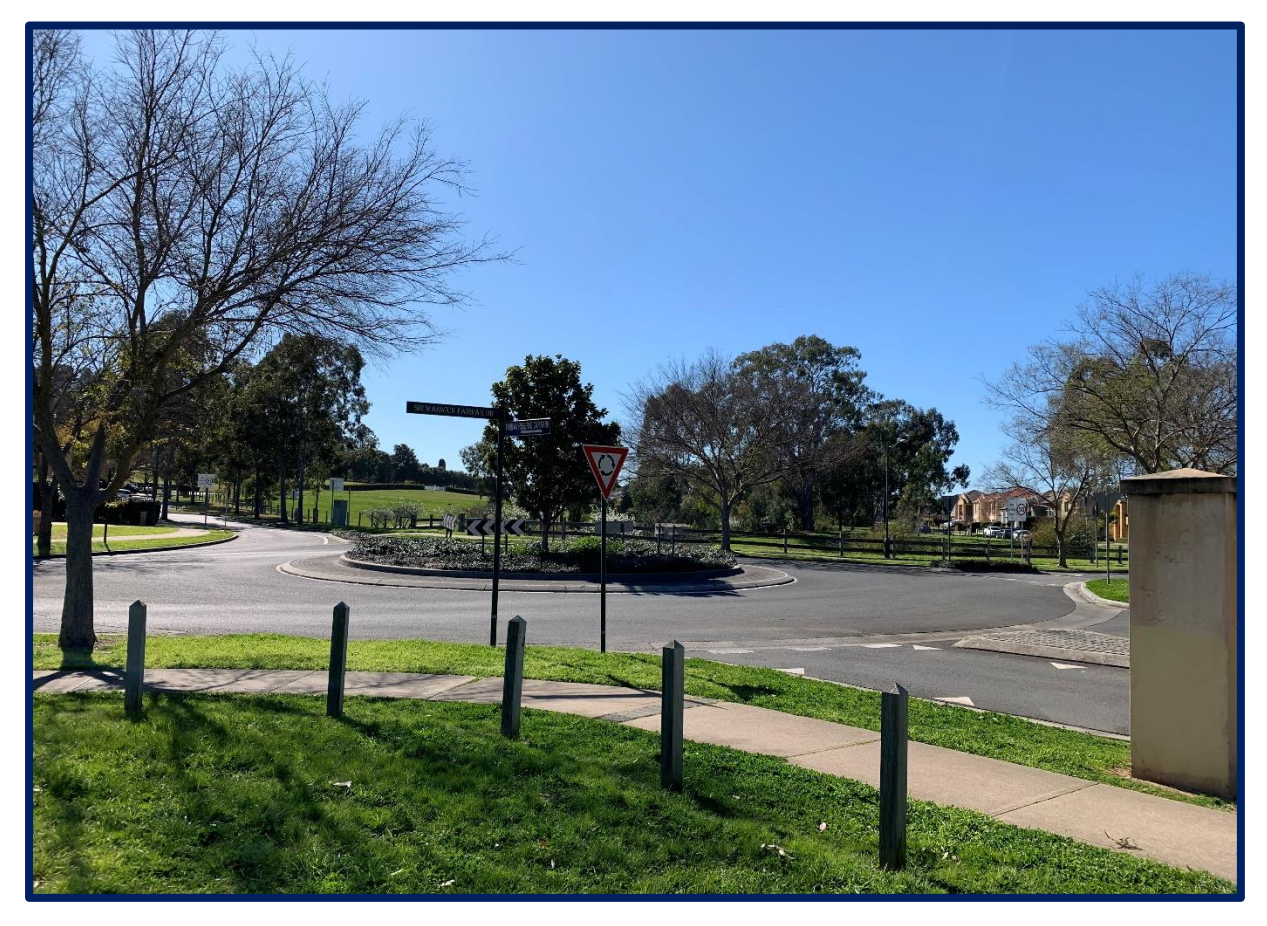
Figure 7: Roundabout on Sir Warwick Fairfax Drive and Hambledon Circuit – Views beyond the roundabout are of Fairfax Reserve extends further north and hold the State Heritage Item – Harrington Park Homestead.