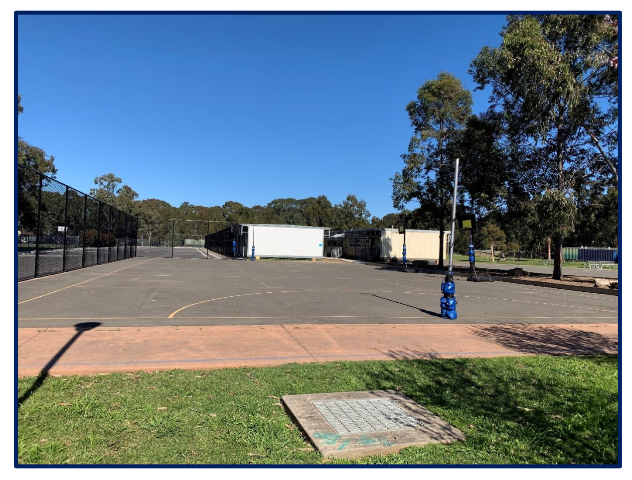
Figure 14: View looking south toward the existing netball courts and demountable buildings to be removed.