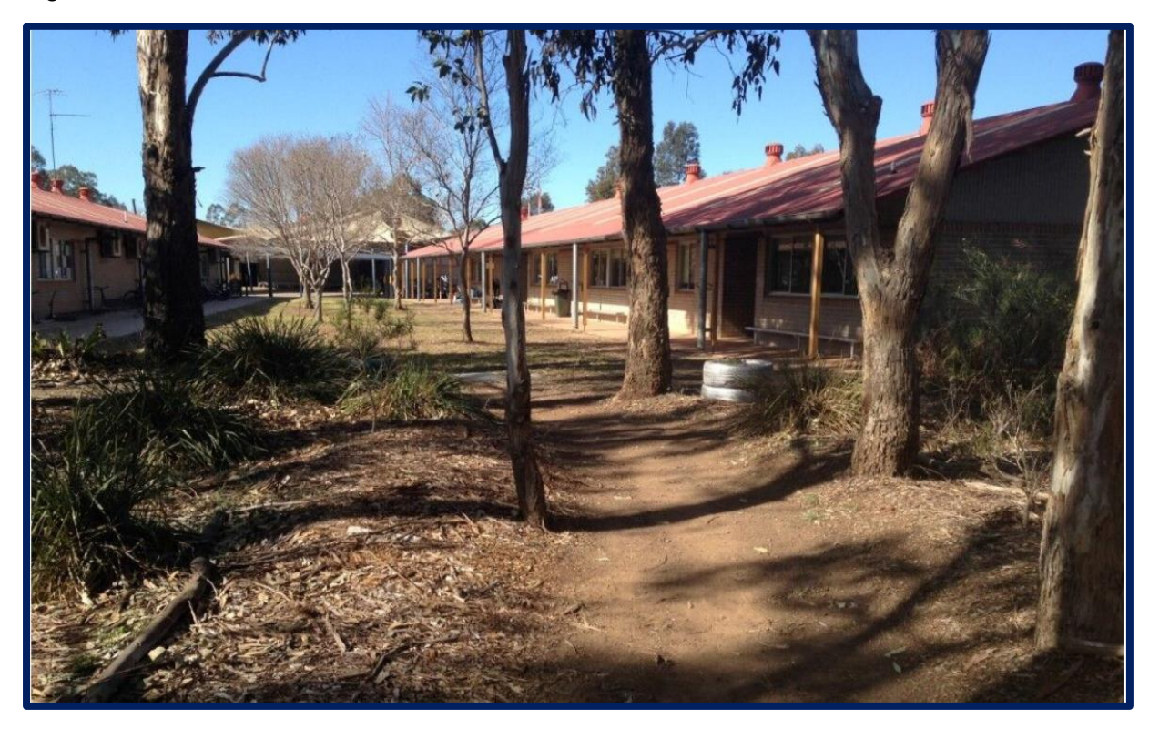
Figure 4: Existing School Blocks