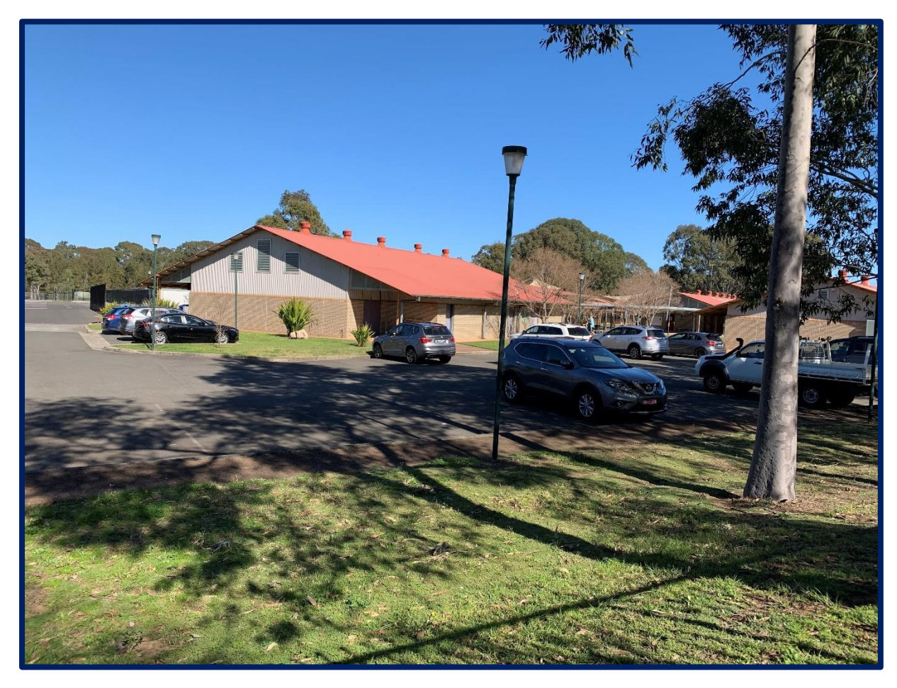
Figure 9: View of the existing eastern car park and hall building which is to be demolished and replaced with a new library and administration building.