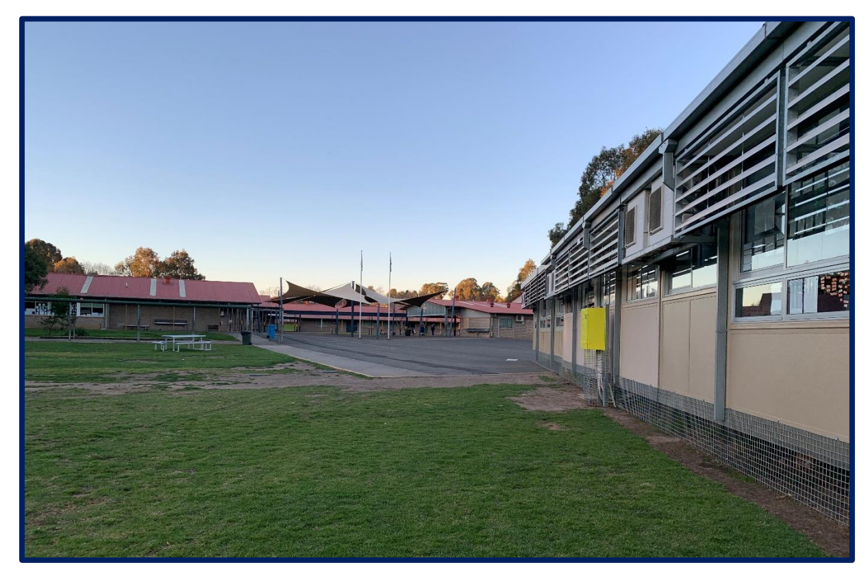
Figure 13: View looking north of Learning Block J and the remaining school site.