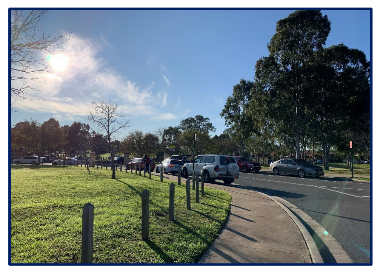
Figure 11: View of the second kiss and drop bay from the access road looking north toward Sir Warwick Fairfax Drive.