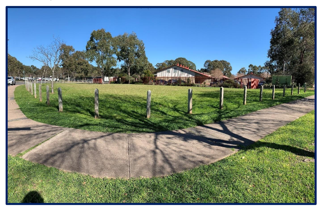
Figure 8: Eastern corner of the site along Sir Warwick Fairfax Drive and the Access Road

Figure 7: Roundabout on Sir Warwick Fairfax Drive and Hambledon Circuit – Views beyond the roundabout are of Fairfax Reserve extends further north and hold the State Heritage Item – Harrington Park Homestead.