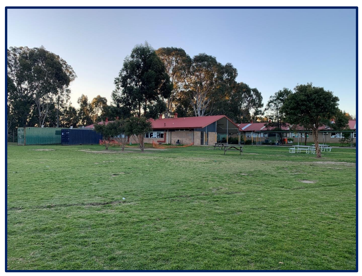
Figure 16: View looking north toward the existing Learning Block J.

Figure 15: View looking west toward the existing Learning Block J which is to be removed and replaced with the new Learning Block J Building.