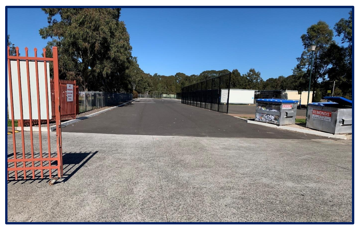
Figure 13: View of the existing south eastern car park